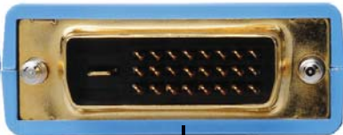
Receiver Front Panel