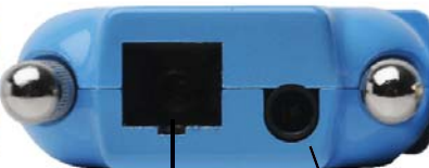
Receiver Back Panel