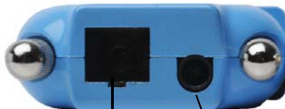
Sender Back Panel